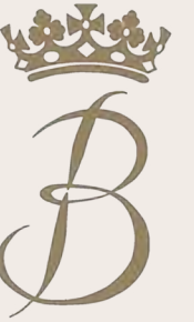
HRH Princess Beatrice Trustee of The Outward Bound Trust